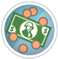
Saving & Investing

MyCreditUnion.gov provides online resources dedicated to helping people of all ages learn how to make smarter financial decisions for a stronger, brighter future.