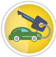
Buying a Car