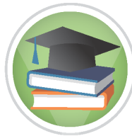
Going to College