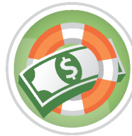
Planning for the Unexpected