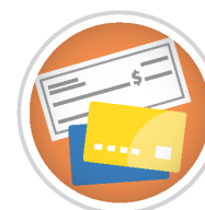
Checking & Credit Cards