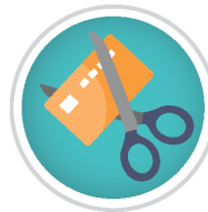
Dealing with Debt